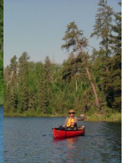
Thomas Feeney (BWCAW Rib Lake '05)