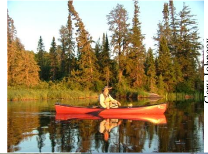
Gary Johncox (BWCAW Cross Bay Lake)

Just to let students and parents know in advance ... Walden will be offering a canoeing class fourth quarter taught by Thomas Feeney that will teach basic canoeing and canoe-camping skills. There will be a couple "practice" day trips; and then the class will culminate in a 3 day/2 night canoe-camping trip on the Wisconsin River.